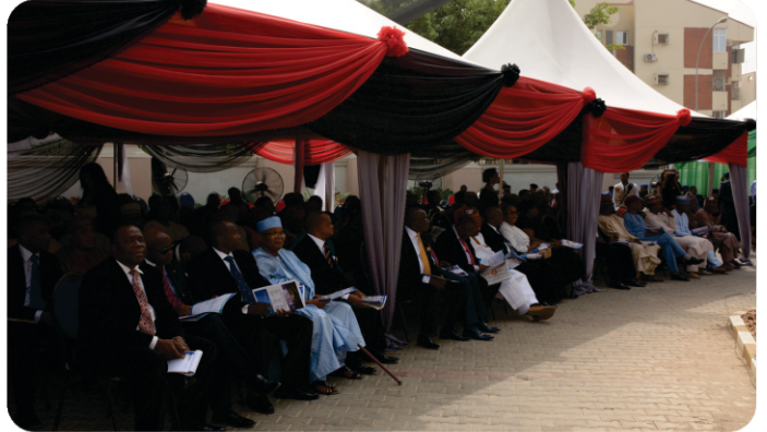
A cross section of dignitaries at the event