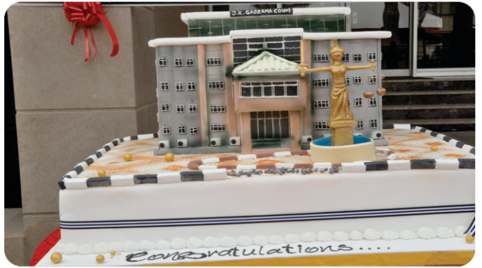
The celebration cake which is a replica of the magnificent building at the commissioning