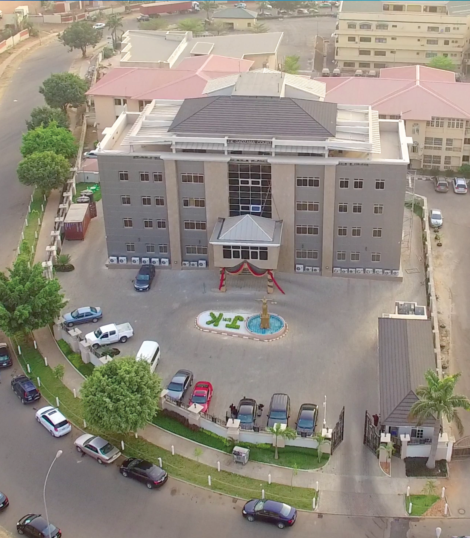
A Panoramic View of J-K Gadzama Court