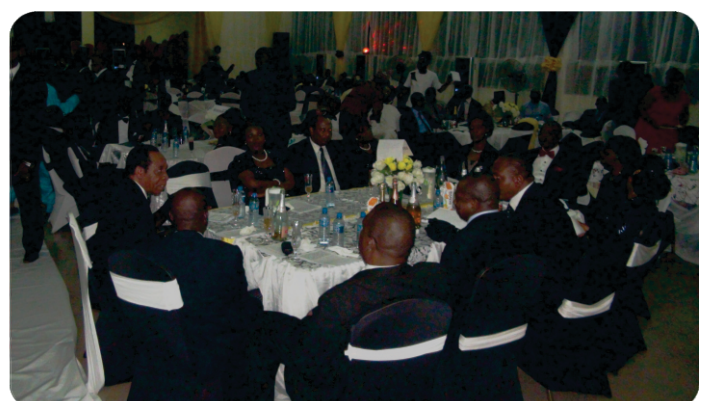
Cross section of dignitaries at the dinner