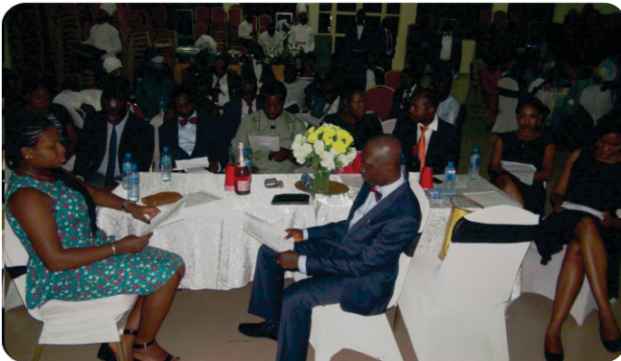
Cross section of guests at the dinner