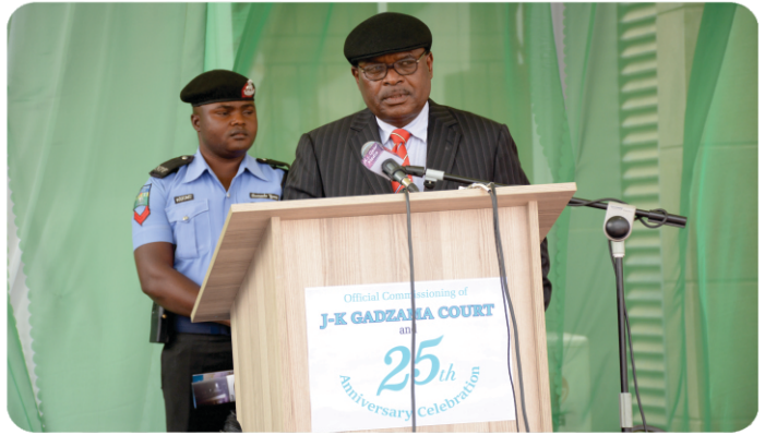
The Honourable Chief Judge of the FCT, Hon. Justice Ishaq Bello delivering a goodwill message at the Formal Commissioning of J-K Gadzama Court